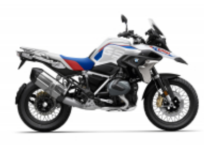
R 1250 GS + $798.45