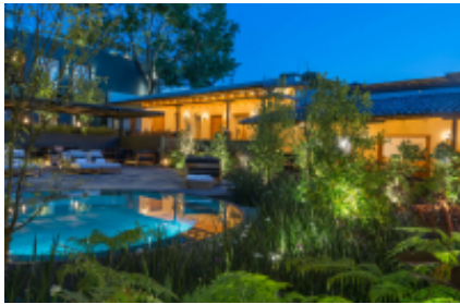
3 - Zimapan - Xilitla - Zimapan - Xilitla