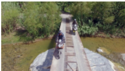
4 - Xilitla - Ciudad Valles - Xilitla - Sótano - Tamul - Ciudad Valles