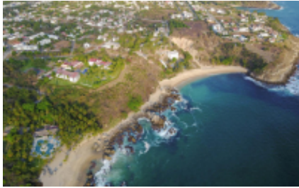
2 - San Juan Teotihuacán - Zimapan - Teotihuacán - La Gloria - Zimapan