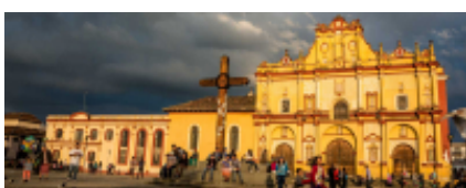
6 - Peña de Bernal - Guanajuato - Peña - San Miguel - Guanajuato