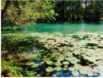
1 - Mexico City - San Juan Teotihuacán - 0 Airport - Teotihuacan (Van)