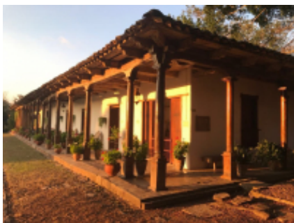
5 - Ciudad Valles - Peña de Bernal - Ciudad Valles - Peña de Bernal