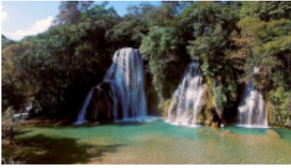
8 - Guanajuato - Morelia - Guanajuato - Morelia