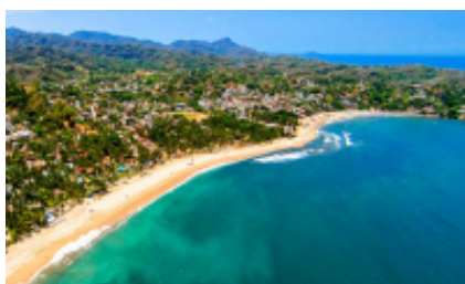
5 - Sayulita - Circuito Sayulita - Sayulita