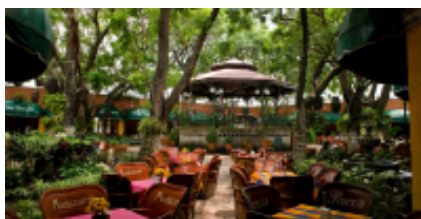
4 - Tequila - Sayulita - Tequila - Sayulita