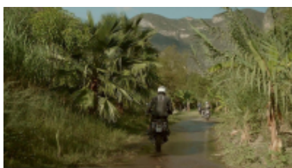
6 - Sayulita - Tlaquepaque - Sayulita - Tlaquepaque