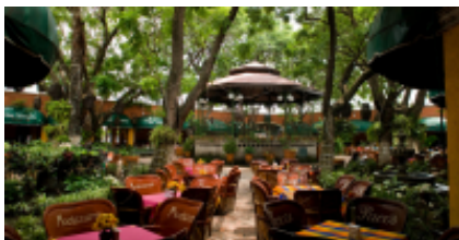
4 - Tequila - Sayulita - Tequila - Sayulita