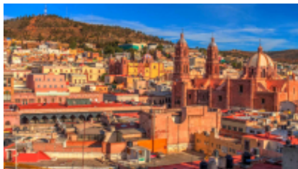
1 - Mexico City - Valle de Bravo - CDMX - Valle de Bravo (van)