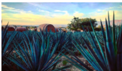
3 - Morelia - Tequila - Morelia - Tequila