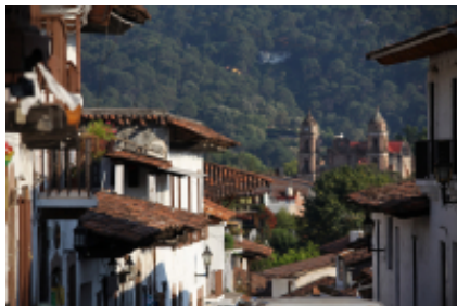
2 - Valle de Bravo - Morelia - Valle de Bravo - Morelia