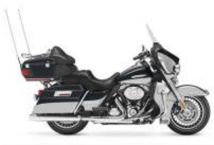
Road Glide Ultra Grand Touring Class + $0.00