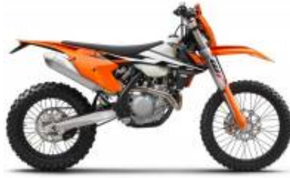
EXC 450 + $0.00