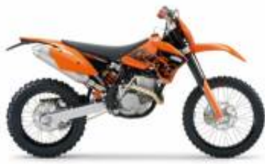
EXC 250 + $0.00