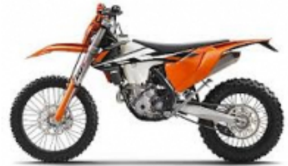
EXC 350 + $0.00