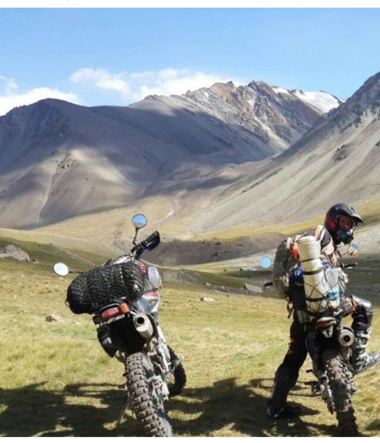
Motorcycle dual-purpose and Adventure Georgia Caucasus short enduro