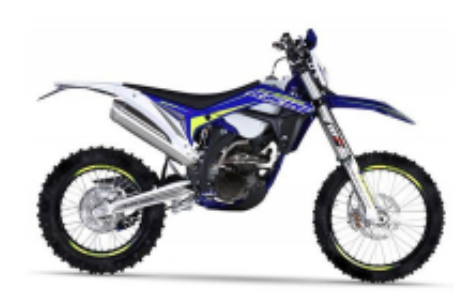
Sherco SEF 350 + $0.00