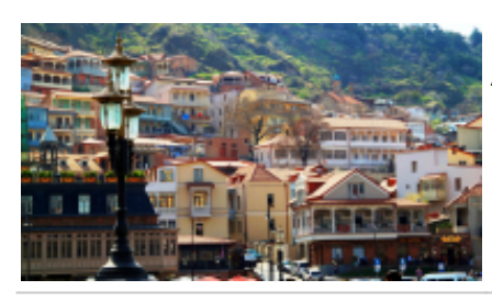
1 - Tbilisi - Tbilisi - 0

Arrival at Tbilisi International Airport and transfer to the hotel.