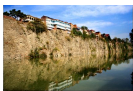
10 - Tbilisi - Tbilisi - 0 In the morning, departure to the airport for home.