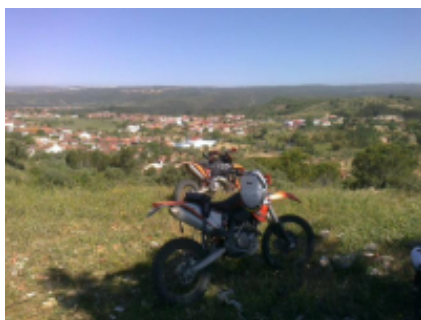
3 - Santarem - Santarem - 150 km