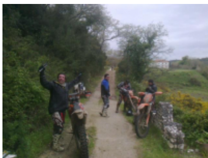
2 - Santarem - Santarem - 160 km