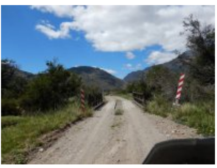
9 - El Calafate - Perito Moreno - 140

A long day awaits us! We will descend along the legendary Route 40, through the desertic Patagonian steppe, between turquoise-colored lakes and rivers. We will enjoy sightings of numerous guanacos and perhaps have the chance to see ñandús, armadillos, and foxes. In the afternoon, we will arrive at a beautiful hotel near Lake Argentino, where we can rest and appreciate the city of El Calafate.