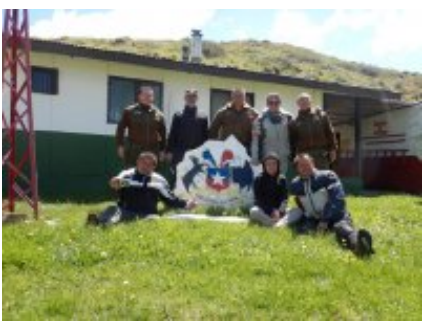
10 - El Calafate - Puerto Natales - 387

If you wish, you can join us to visit the Los Glaciares National Park, a UNESCO World Heritage site, and be amazed by the impressive Perito Moreno Glacier.