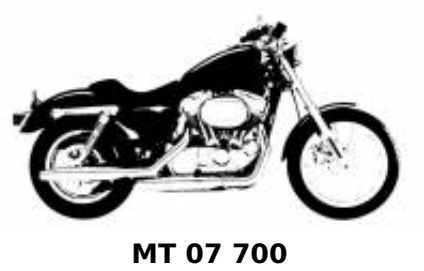
MT 07 700 + 0,00 €