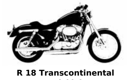
R 18 Transcontinental + 0,00 €