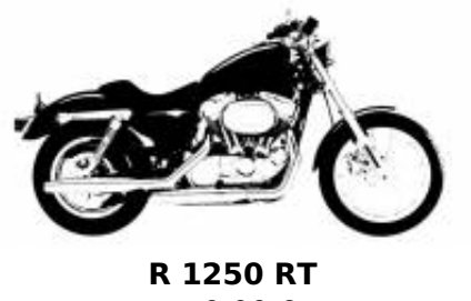
R 1250 RT + 0,00 €