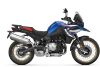
F 850 GS + $2,194.87