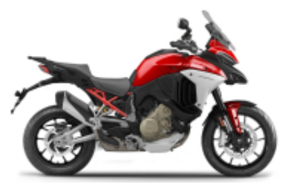
Multistrada V4 + $0.00