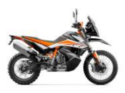
790 Adventure + $0.00