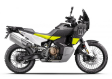
Norden 901 + $0.00