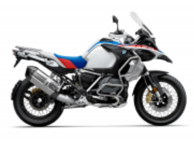
R 1250 GS Adventure + $0.00