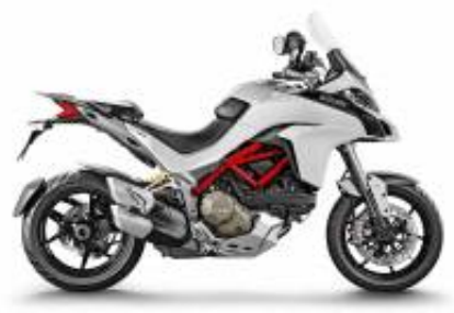
Multistrada 1260 V4 + $0.00