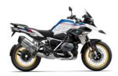
R 1250 GS HP Edition + $0.00