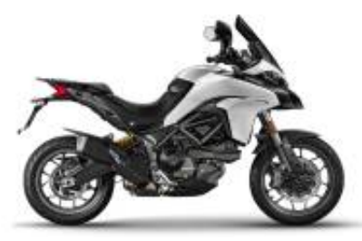
Multistrada 950 V2 + $0.00