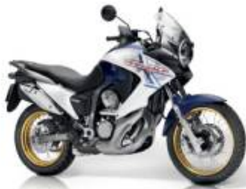
XL Transalp 700 + $0.00