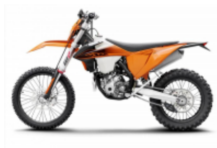
TPI/Six Days 300 + $0.00