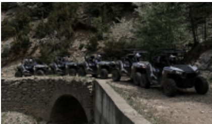
3 - Errachidia - Errachidia -