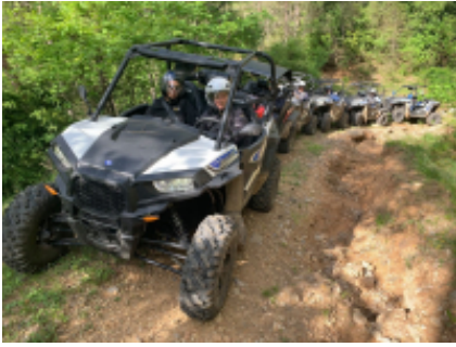
1 - Errachidia - Errachidia -