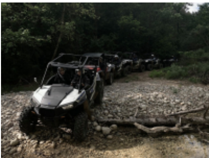
4 - Errachidia - Errachidia -