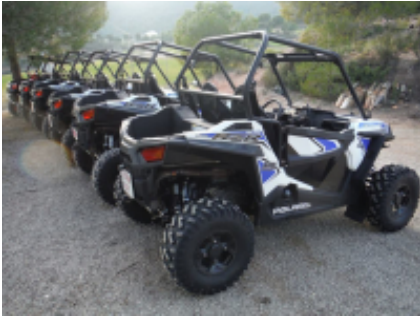
2 - Errachidia - Errachidia -