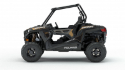
RZR 900 + $0.00