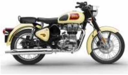
Classic 500 + $52.32