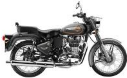
Bullet 500 + $52.32