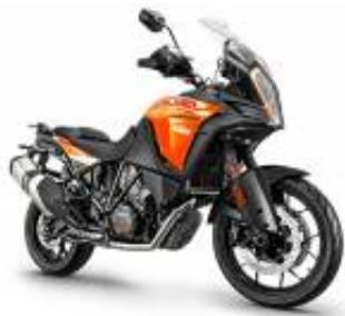
1290 Adventure S + $0.00