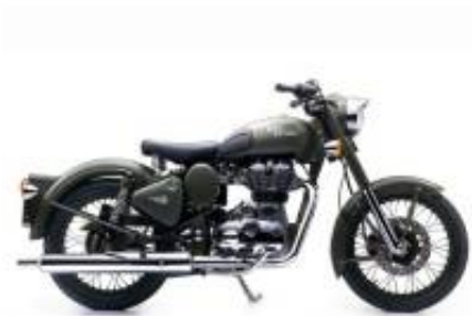
Military 500 + $0.00