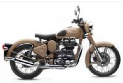
Classic Desert Storm 500 + $0.00