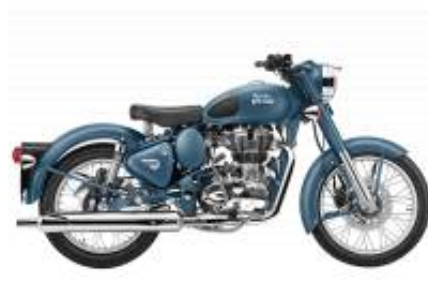
Squadron Blue 500 + $0.00