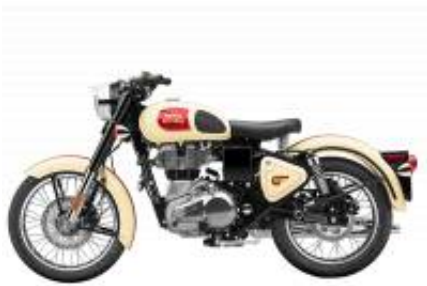
Tan 350 + $0.00