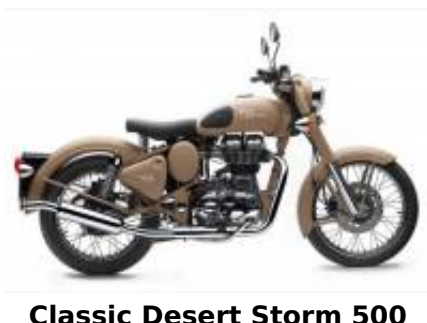
Classic Desert Storm 500 + $0.00