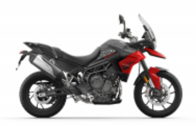
Tiger 850 Sport + $100.00