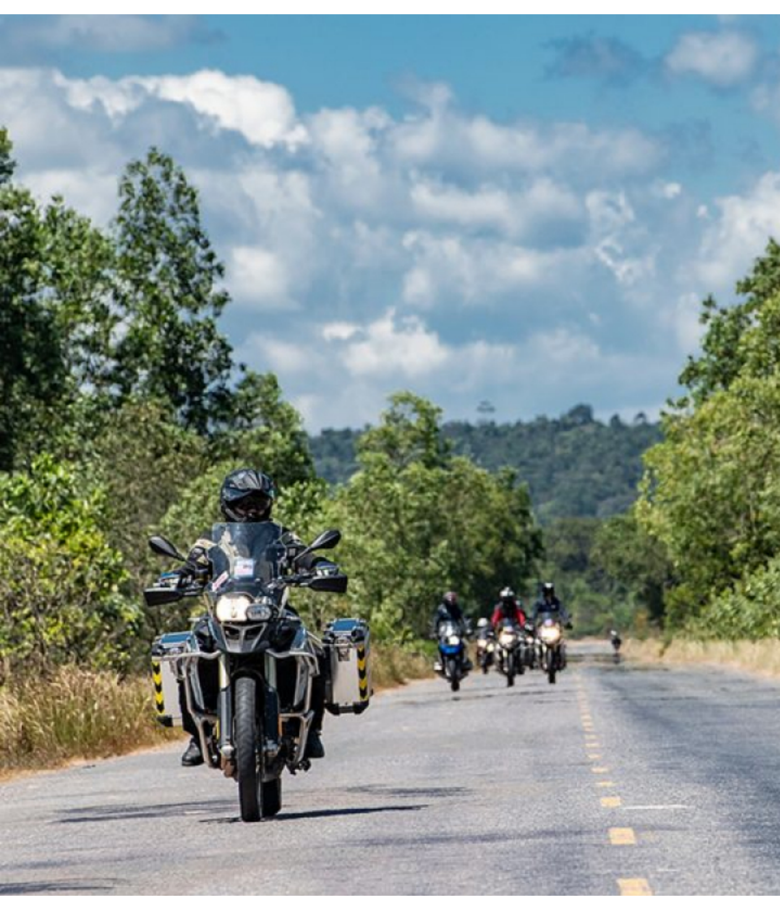
Motorcycle dual-purpose and Adventure Thailand, Amazing Land of Lanna