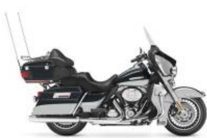
Road Glide Ultra Grand Touring Class + 529.75.-