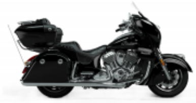
Roadmaster 1890 Grand Touring Class + 583.62.-