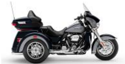
Trike Tri Glide (Gen) + 1'521.90.-