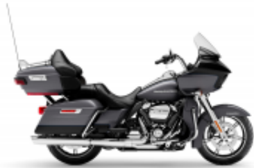
Road Glide Grand Touring Class + 350.17.-