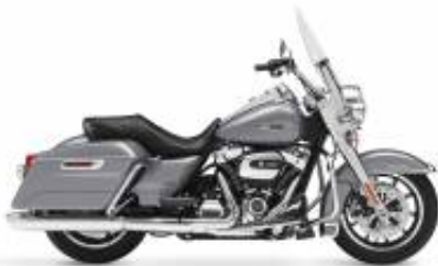
Road King (Gen) Cruiser Touring Class + 233.45.-