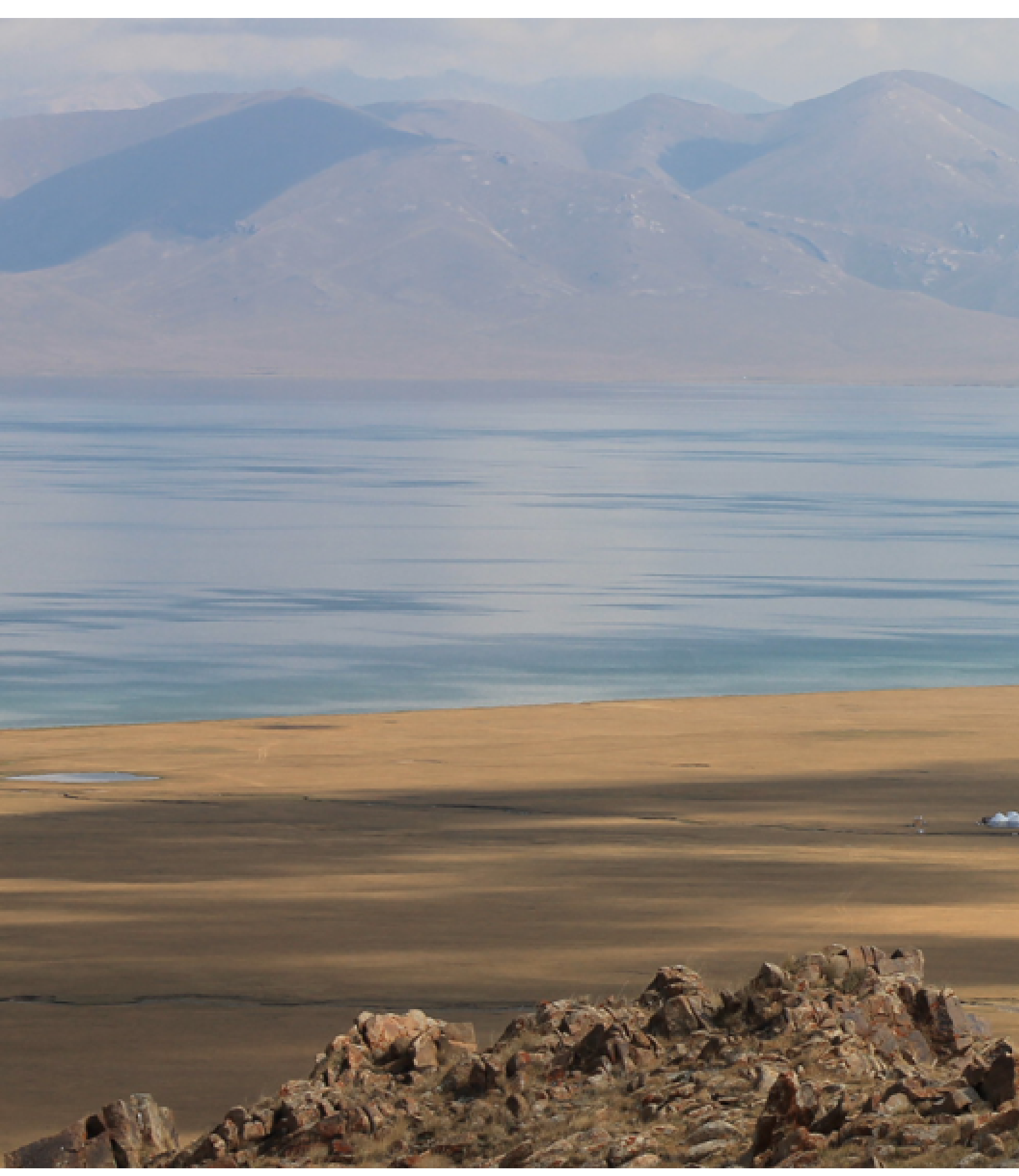
Motorcycle Enduro off Road tour Kyrgyzstan mountains of Tian Shan 10 days.