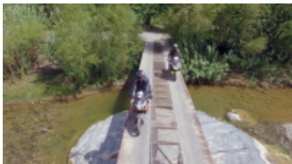
4 - Xilitla - Ciudad Valles - Xilitla - Sótano - Tamul - Ciudad Valles