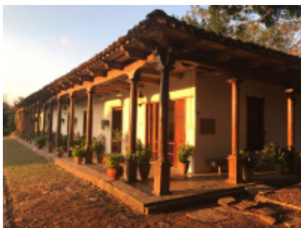
5 - Ciudad Valles - Peña de Bernal - Ciudad Valles - Peña de Bernal