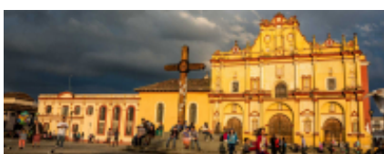
6 - Peña de Bernal - Guanajuato - Peña - San Miguel - Guanajuato