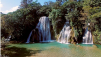
8 - Guanajuato - Morelia - Guanajuato - Morelia