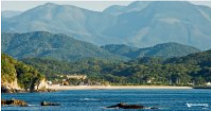
8 - Zacatecas - Guanajuato - Zacatecas - Guanajuato