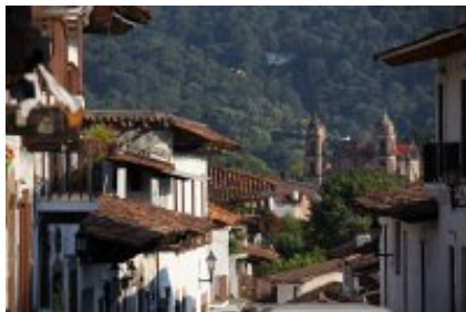
2 - Valle de Bravo - Morelia - Valle de Bravo - Morelia