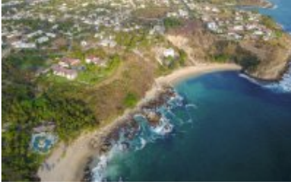
9 - Guanajuato - San Miguel de Allende - Guanajuato - San Miguel Allende