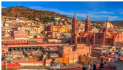
1 - Mexico City - Valle de Bravo - CDMX - Valle de Bravo (van)