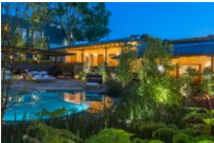
11 - Santiago de Querétaro - Querétaro Intercontinental Airport - Querétaro - Airport (van)