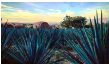
3 - Morelia - Tequila - Morelia - Tequila