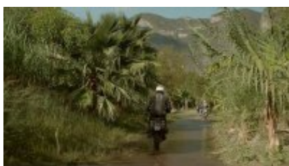
6 - Sayulita - Tlaquepaque - Sayulita - Tlaquepaque