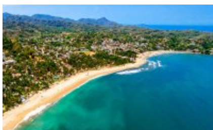
5 - Sayulita - Circuito Sayulita - Sayulita