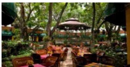
4 - Tequila - Sayulita - Tequila - Sayulita