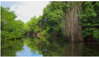
10 - San Miguel de Allende - Santiago de Querétaro - San Miguel Allende - Querataro