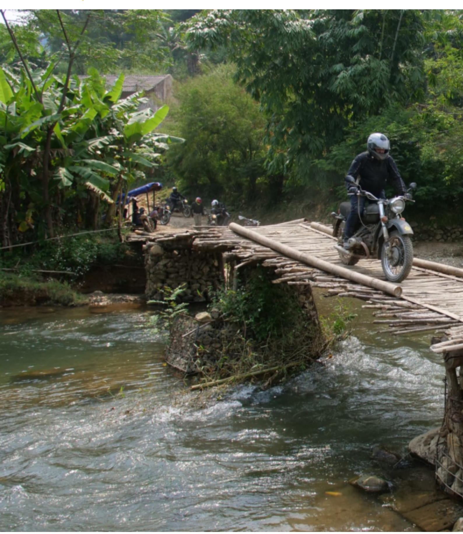
Motorcycle dual-purpose and Adventure Mountains of Vietnam