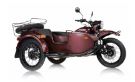
Sidecar + $0.00