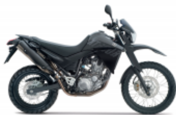
XT 660 R + $970.91