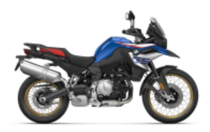
F 850 GS + $272.79