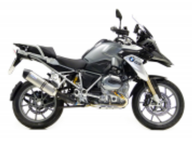
R 1200 GS LC + $272.79