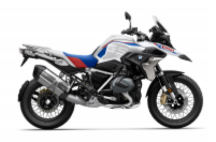
R 1250 GS + $360.09