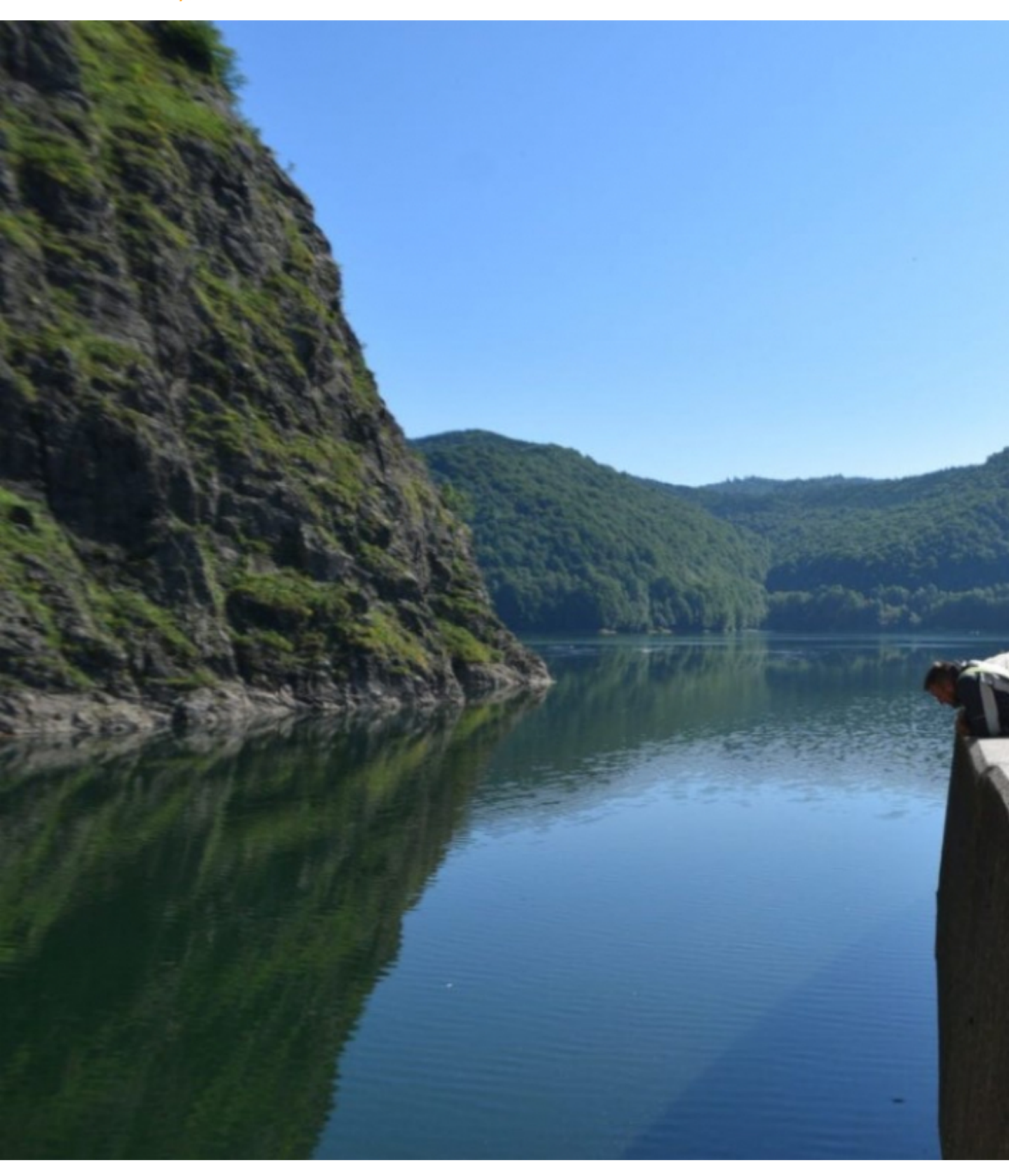
Motorcycle dual-purpose and Adventure Romania 4-Days