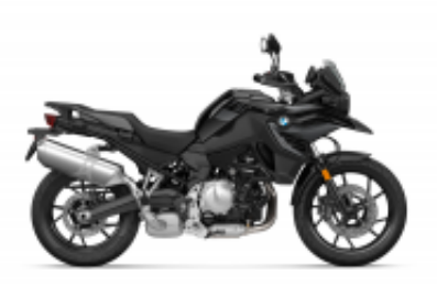
F 750 GS + $272.79