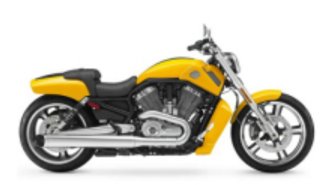
Vrod Muscle + $0.00