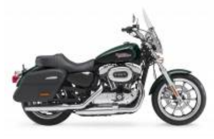
Superlow 1200 T + $0.00