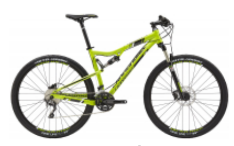
29" Rush 2 + $35.39