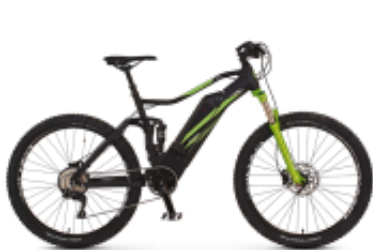
Graveller Sport Drive 10v 27,5 20.ETM.20 + $45.49