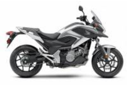
NC 750 X + $0.00