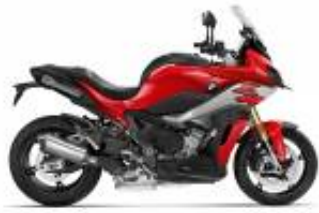
S 1000 XR + $156.27