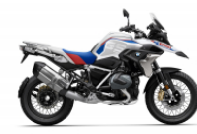
R 1250 GS + $0.00