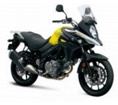
DL 650 V Strom + $70.00