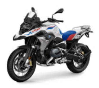
R 1250 GS Rally + $2,712.58