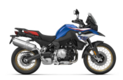
F 850 GS + $2,199.70