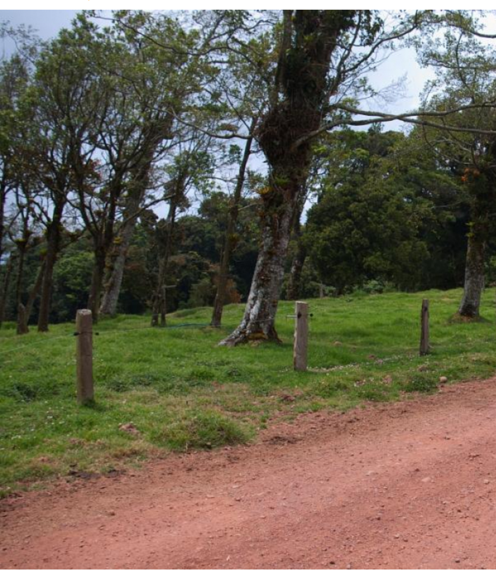
Motorcycle dual-purpose and Adventure Costa Rica self guided on a BMW