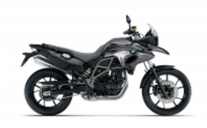
F 700 GS + $0.00