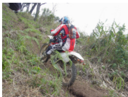
5 - Tabanan - Tabanan -