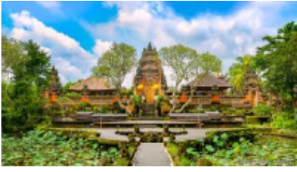
7 - Kintamani - -