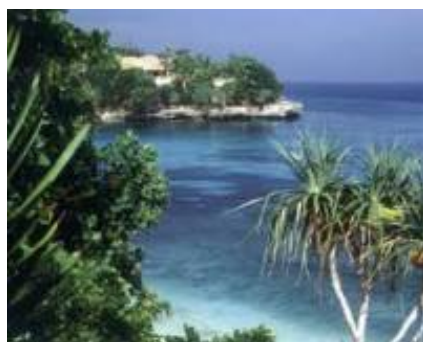
3 - Pekutatan - Negara -