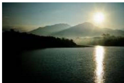
4 - Negara - Tabanan -