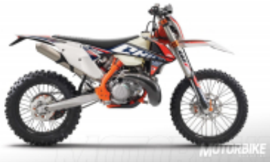
300 2T six days + $639.35