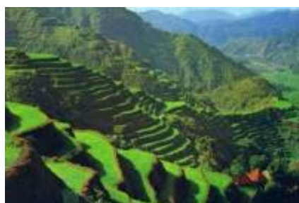
6 - - Kintamani -