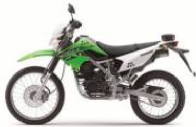
KLX 150 + $0.00