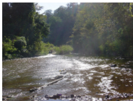
1 - - Nusa Dua -