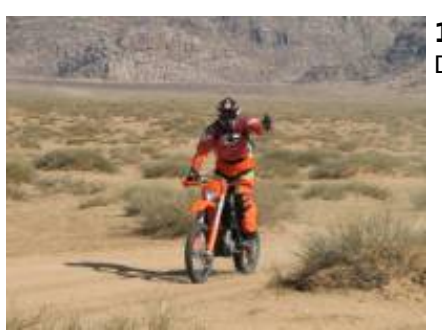
10 - Ulaanbaatar - -Depart.

9 - Uubulan - Ulaanbaatar -Return to Ulaanbaatar.