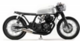
CB 250 Cafe Racer + $0.00