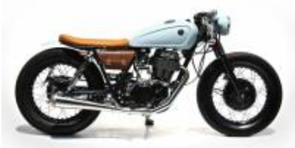
SR 250 Caferacer + $0.00