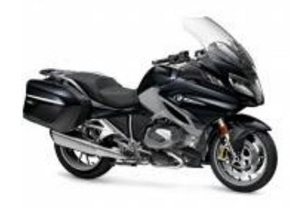
R 1250 RT LC + $510.73