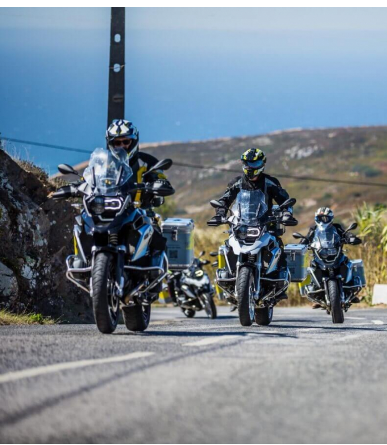
Motorcycle dual-purpose and Adventure the best of Portugal on a BMW