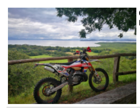
6 - Honda - Honda - Rest Day in Honda.