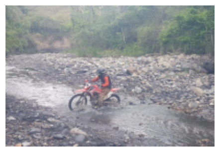
3 - Ubaté - Pacho -