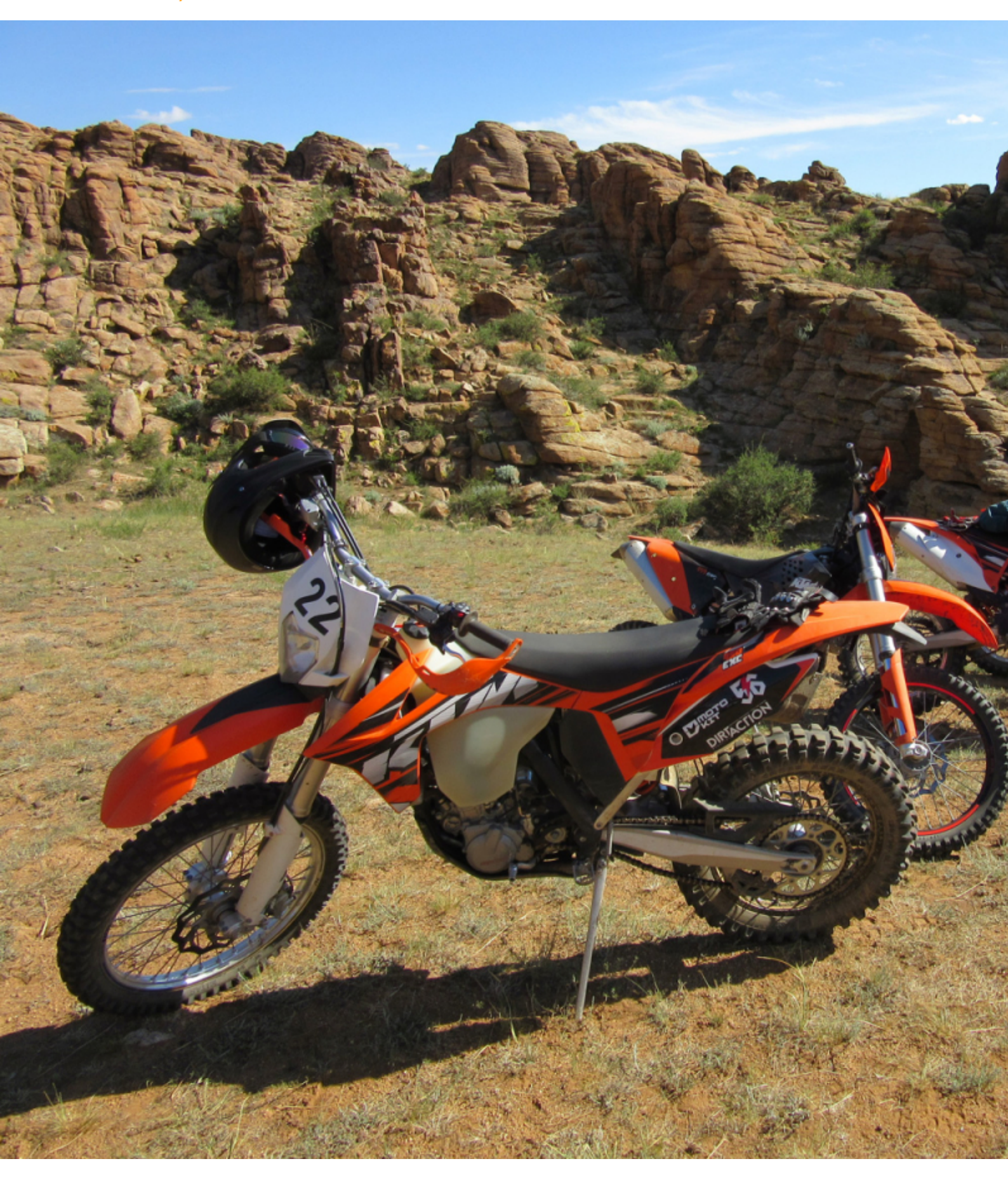
Motorcycle Enduro off Road tour Mongolia to the Birthplace of Genghis Khan