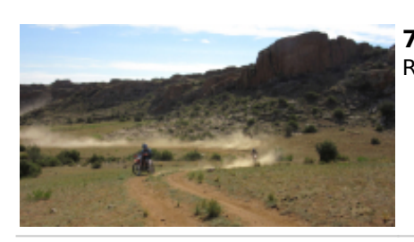
7 - Jargalant - Ulaanbaatar - Return to Ulaanbaatar.