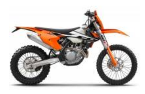
EXC 450 + $0.00