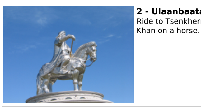
2 - Ulaanbaatar - Khukh nuur - Ride to Tsenkhermandal, on the way visiting the huge silver statue of Genghis