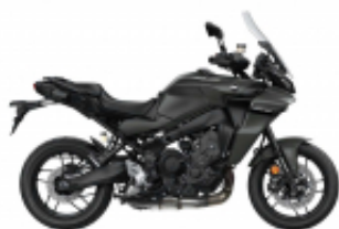
Tracer 900 GT