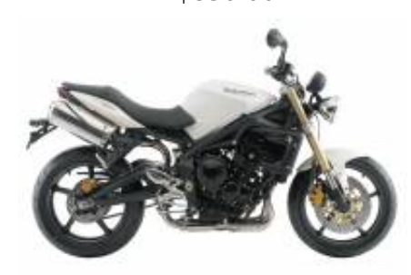
Street Triple 675 + $850.00