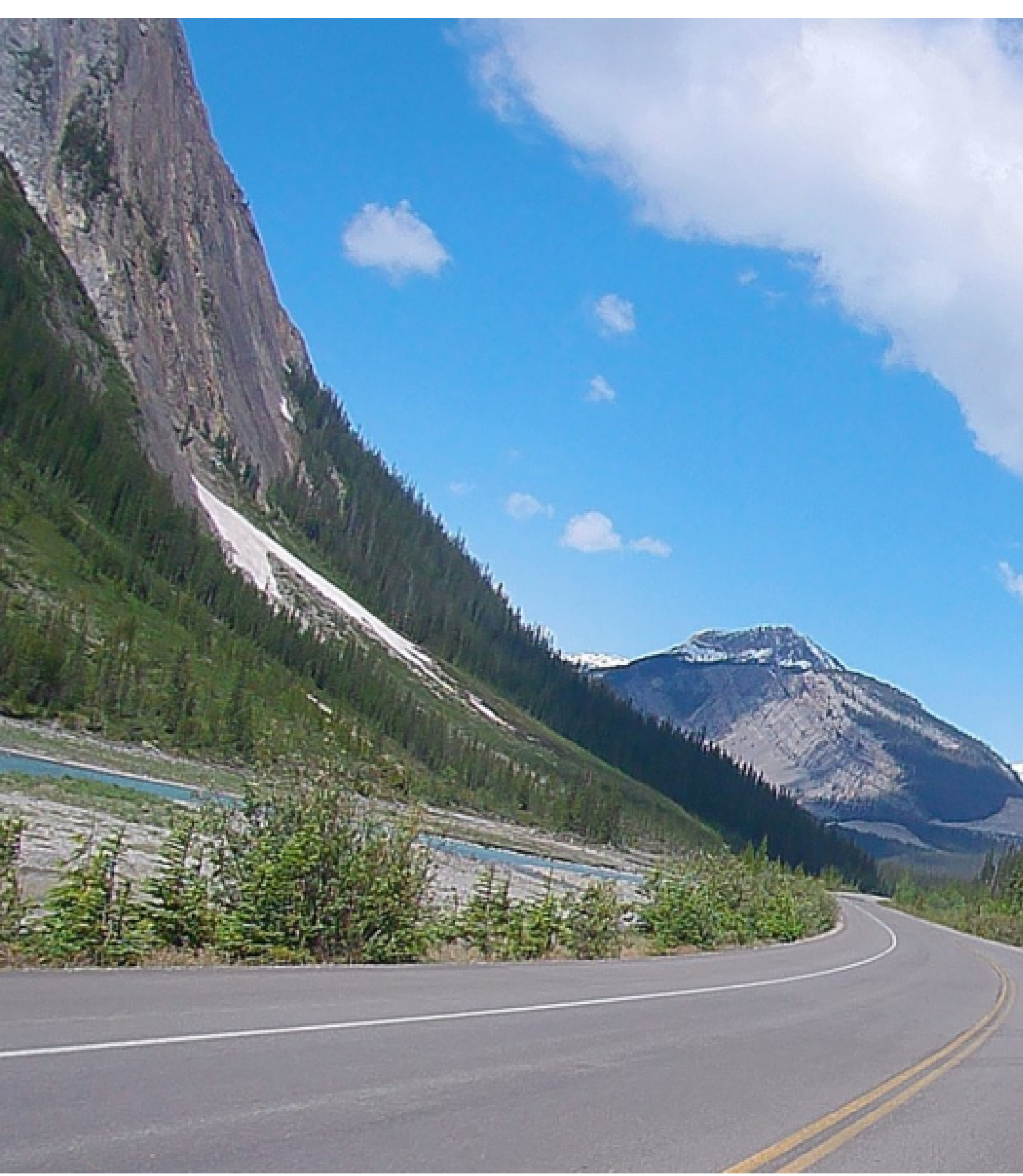
13-day Fully Guided Motorcycle Tour through the Canadian Rocky Mountains