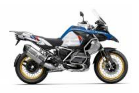
R 1250 GS Adv LC + $197.27