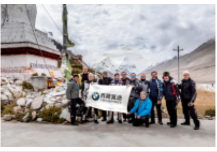
5 - Shigatse - Saga County - 450