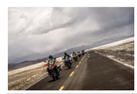
Zada Earth Forest