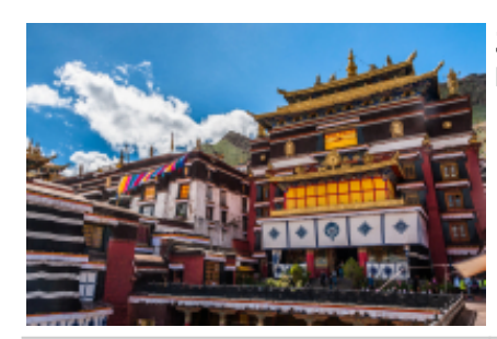
3 - Lhasa - Lhasa - 0

We start today's Lhasa exploration with an exciting visit to iconic Potala Palace, regarded as one of the most beautiful buildings in the world.In addition, we will also visit Jokhang Temple which is considered the spiritual heart of Tibetan Buddhism.Our trip will not be completed without walking Barkhor Street, the ancient route to circumambulate Jokhang Temple. The last site of the day will be the famous Sear Monastery, where you will have the opportunity to observe monks debating in a courtyard as they have done for hundreds of years. Application for a local motorcycle driver's license. Lhasa city tour: Jokhang Temple→Barkhor street okhang Temple→Barkhor street