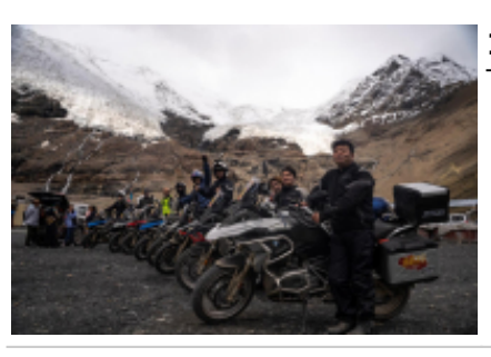
12 - Shigatse - Damxung County - 350 Tashilhunpo Monastery