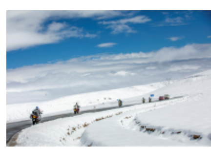
10 - Saga County - Rongbuk Monastery - 380 Peiku Tso Lake/ Mt.Shishapama/ Mt. Everest