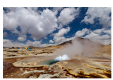
6 - Saga County - Kangrinboqe Peak - 490