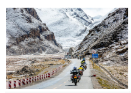
9 - Burang County - Saga County - 540 Lake Manasarovar/ Mt.Kailash