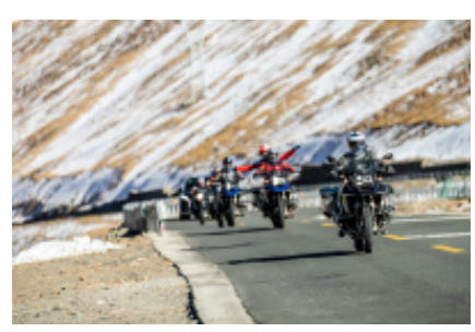
4 - Lhasa - Shigatse - 365

Lhasa city tour: Potala Palace. Test ride to Ganden Monastery