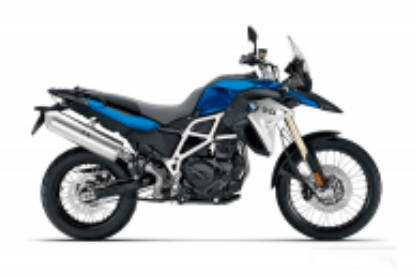
F 800 GS + 881,13 €