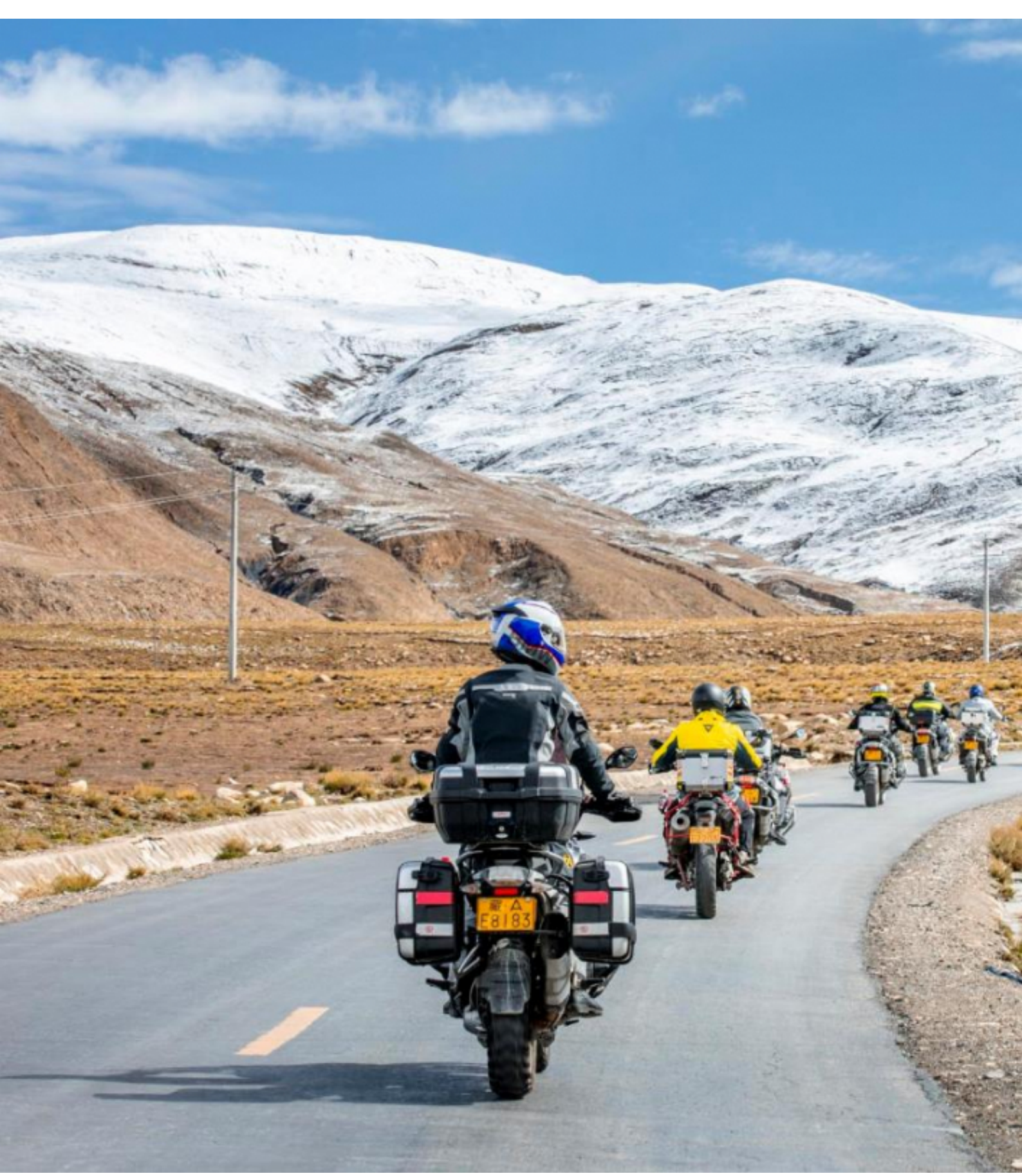
Motorcycle dual-purpose and Adventure Tibet. Mount Kailash.