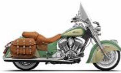
Chief Vintage + $390.00