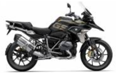
R 1250 GS LC + $520.92