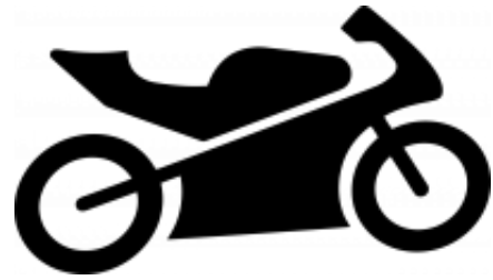
My own motorbike + $0.00