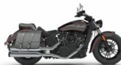
Scout Sixty + $700.00