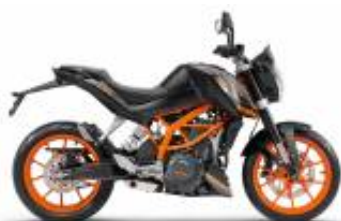
Duke 390 + $0.00