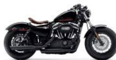
Sportster 1200 + $0.00