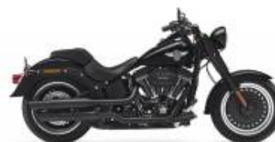
Fat Boy + $700.00