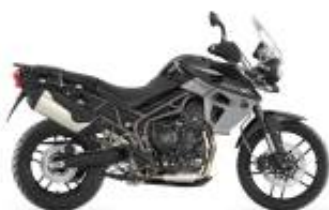
Tiger 800 XRX + $700.00