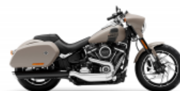
Sport Glide + $700.00