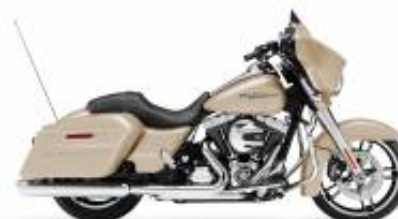
Street Glide Special + $700.00