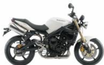
Street Triple 675 + $700.00