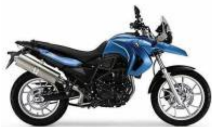
G 650 GS Twin + $700.00