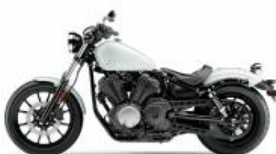
XV 950 Bolt + $700.00