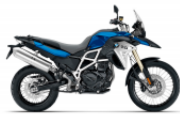
F 800 GS + $322.97